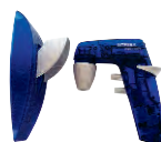
royal 156 004