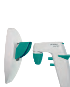
classic 156 000