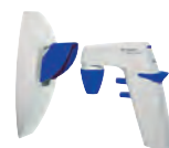
pacific 156 002