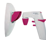
volcano 156 001