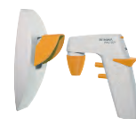
sahara 156 003