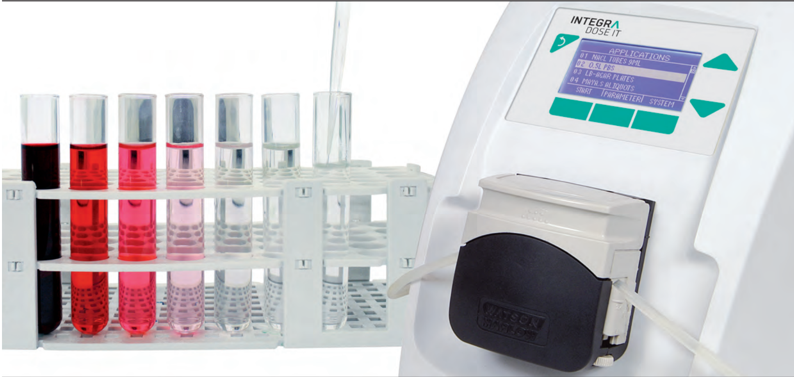
DOSE IT Compact and Easy-to-use Peristaltic Pump