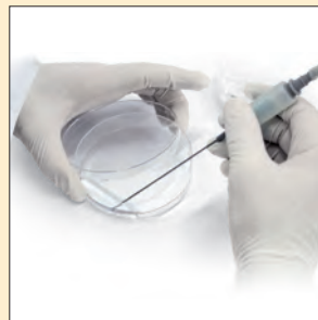
Coating of Petri dishes