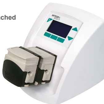
Second pump attached

The DOSE IT pump head accommodates different tubing sizes (1 - 8 mm) so that a wide range of volumes – from milliliters to litres – can be dispensed with speed and precision. The flow rate can be doubled by using a second pump head, a modification that can also be used to minimize flow pulsation.