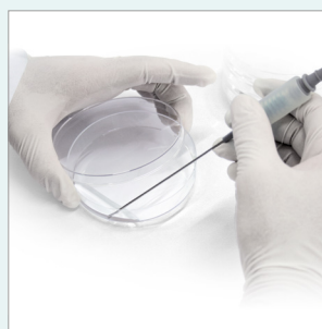
Coating of Petri dishes