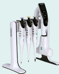
Short linear stand (3214)