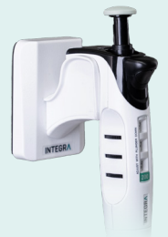
Wall mount (3205)