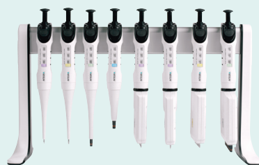
Linear stand (3215)