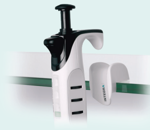
Shelf hook (3210 and 3211)