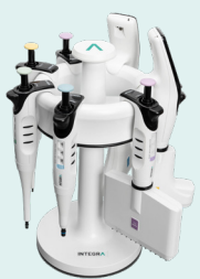
Pipette rotary stand (3213)