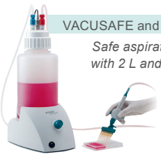
VACUSAFE and VACUBOY

Liquid aspiration, collection, disposal and pump systems