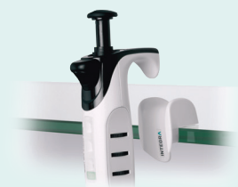
Shelf hook (3210 and 3211)