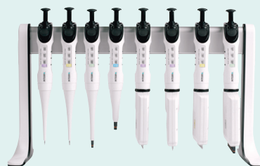
Linear stand (3215)

Storing pipettes upright is important to prevent liquid or debris from entering the tip fitting, as well as being crucial for ensuring its longevity. Both the INTEGRA linear stand – which holds up to twelve manual pipettes – and the shelf hook are ideal for storing EVOLVE pipettes off the lab bench.