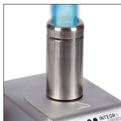
Long burner head