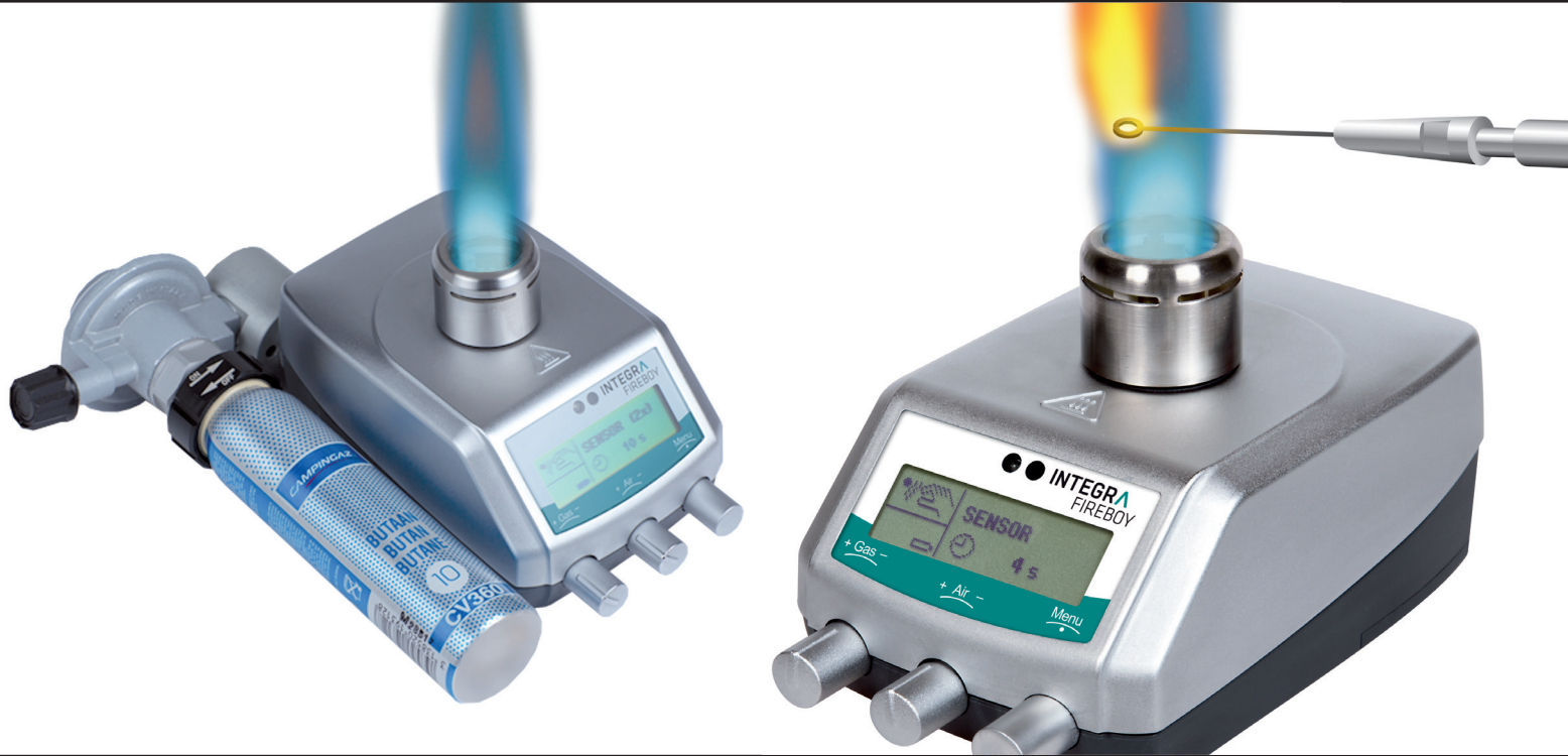
FIREBOY Safety Bunsen Burner