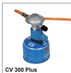
CV 300 Plus