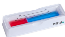
25ml, 25ml-Divided, and 12 Well